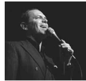
Kurt Elling.